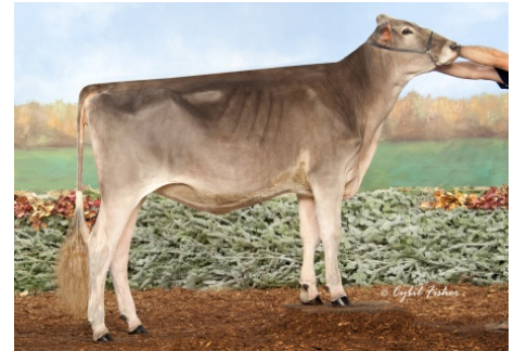
Wind Mill Carter Snow Angel Res. Jr. Champion World Dairy Expo, 2018