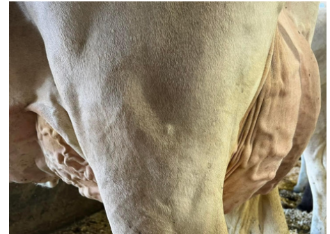
Hilltop Acres S Nutella 'E 90 E 91 MS'