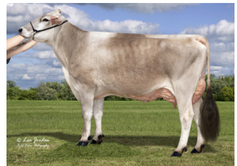
Hilltop Acres S Nutella 'E 90 E 91 MS' 2nd Lact Dam of 179BS16 NITRO

Sire: Rastaroket Dam: Hilltop Acres S Nutella 'E 90 E 91 MS' 1-8 305d 3x 27,250 4.5 1,223 3.5 944 2-8 365d 3x 39,061 4.9 1,902 4.0 1,575 MGS: La Rainbow Sweet Silver-ET MGD: Hilltop Acres Pat Nadine 'V 87 87 MS' 3-3 305d 3x 29,550 4.8 1,406 3.7 1,088 4-2 365d 3x 35,070 4.8 1,692 3.6 1,259