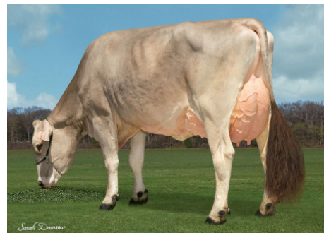
Hilltop Acres S Nutella 'E 91 E 92 MS' 3rd Lact DAM OF 179BS16 NITRO

Sire: Rastaroket Dam: Hilltop Acres S Nutella 'E 91 E 92 MS' 1-8 305d 3x 27,250 4.5 1,223 3.5 944 2-8 365d 3x 39,061 4.9 1,902 4.0 1,575 MGS: La Rainbow Sweet Silver-ET MGD: Hilltop Acres Pat Nadine 'V 87 87 MS' 3-3 305d 3x 29,550 4.8 1,406 3.7 1,088 4-2 365d 3x 35,070 4.8 1,692 3.6 1,259