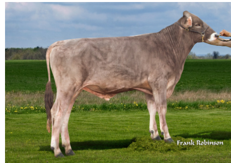
179BS16 Hilltop Acres Rokat Nitro ETV