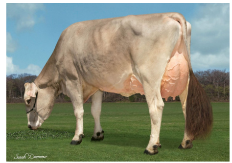
Hilltop Acres S Nutella '2E 92 E 92 MS' 3rd Lact DAM OF 179BS16 NITRO

Sire: Rastaroket Dam: Hilltop Acres S Nutella '2E 92 E 92 MS' 2-8 365d 3x 39,061 4.9 1,902 4.0 1,575 3-11 365d 3x 41,530 5.1 2,103 3.9 1,602 MGS: La Rainbow Sweet Silver-ET MGD: Hilltop Acres Pat Nadine 'V 87 87 MS' 3-3 305d 3x 29,550 4.8 1,406 3.7 1,088 4-2 365d 3x 35,070 4.8 1,692 3.6 1,259