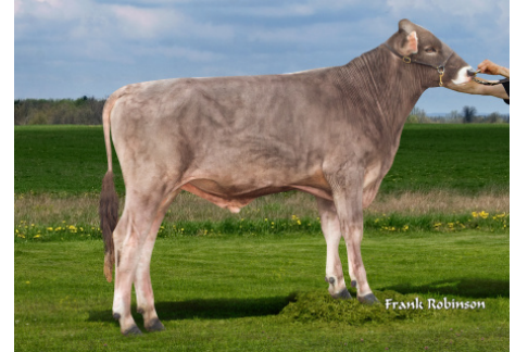
179BS16 Hilltop Acres Rokat Nitro ETV