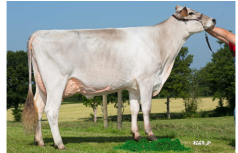
La Champroniere Blooming Majeste 'V 86' 3RD DAM OF 180BS1658 TOMY *P