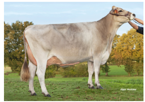
La Champroniere Barca Romy 'V 87 V 86 MS' DAM OF 180BS1658 TOMY *P

Sire: VIVEK *P Dam: La Champroniere Barca Romy 'V 87 V 86 MS' 3-03 305d 2x 21,566 5.5 1,1,84 4.0 869 MGS: H. Scherrer's Haegar BARCA MGD: La Champroniere Ombrelle-ET '+ 83 + 84 MS' 2-04 305d 2x 18,248 4.1 752 3.6 650