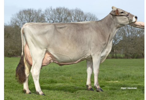
Sinatra Olysee FULL SISTER TO MGD OF 180BS1658 TOMY *P