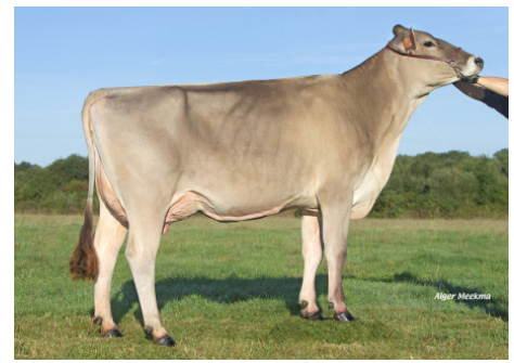
Lilipus 'V 87 V 88 MS' Dam of 180BS94448 O MALLEY 2-04 346d 2x 16,583 4.8 789 3.7 621 3-06 321d 2x 20,893 4.5 940 3.6 752