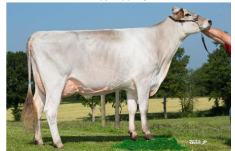
LA CHAMPRONIERE MAJESTE 'V 86'