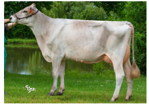
DAM: LA CHAMPRONIERE O MALLEY OCEANE 'V 85 V 86 MS'