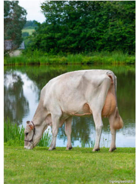
DAM: LA CHAMPRONIERE SINATRA OCEANE 'V 85 V 86 MS'