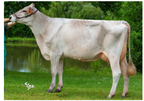
DAM: LA CHAMPRONIERE SINATRA OCEANE 'V 85 V 86 MS'