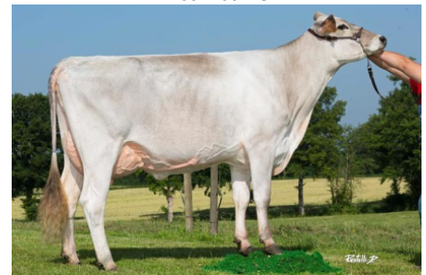
LA CHAMPRONIERE MAJESTE 'V 86'