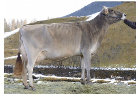
Dam: Pleisch's Vigor Valenzia 'E 92 E 92 MS'