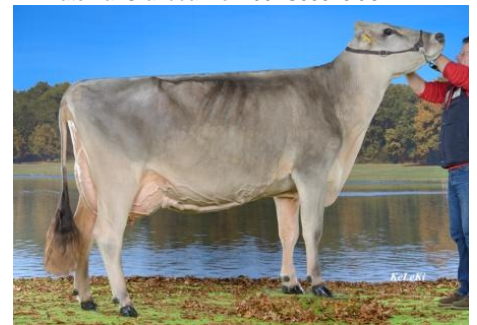
3rd Dam: Jolahofs Vigor Jola 'V 89 E 90 MS' 4-10 305d 2x 28,202 4.1 1,168 3.4 955 Lifetime: 1,646d 96,859m 4,061f 3,388p 2nd Place European Championship Show 2012 Class Winner at IGBS Show 2013