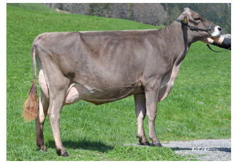
Dam: Portmann BS Smart Jessie ET "+ 83" 2-11 305d 2x 19,840 3.5 702 3.6 708 Dam of 196BS55878 JONMAR