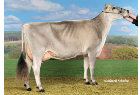
MGD: GS Alliance Glenn J Lo 'V 88 V 88 MS' 2-03 305d 2x 17,813 4.1 735 3.6 640 3-07 305d 2x 21,952 4.1 882 3.6 774 R.I.P. 5-07 100d 2x 6,688 4.1 271 3.0 198 Lifetime: 54,250m 2,229f 1,960p Maternal Granddam of 196BS55878 JONMAR