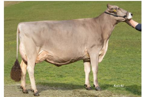
Maternal Sister to Alpin's Dam: Salomon Simona