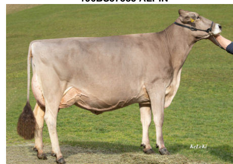
Maternal Sister to Alpin's Dam: Salomon Simona