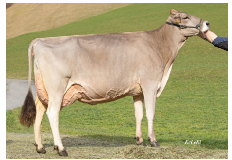
ARROW ANNIKA 'E 93 E 94 MS' DAM OF 196BS57585 ALPIN

Sire: ALDO-SG ET Dam: ARROW ANNIKA 'E 93 E 94 MS' 5-11 305D 2X 20,955 4.3 906 3.9 811 LIFETIME: 1,900D 110,013M 4,698F 4,273P MGS: ANIBAL ARROW MGD: BLOOMING BALI 'E 93 E 92 MS' 7-02 305D 2X 20,499 4.0 814 3.6 734 Lifetime- 7 LACTATIONS 2,081D 124,477 4.0 4,989 3.6 4,506