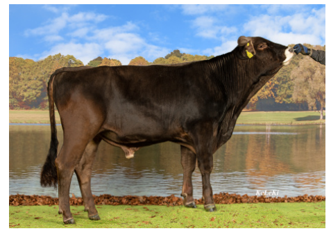
196BS57617 HALANO *P

European Bulls (USA Only) CALANO SG X VICTOR *P X ANIBAL