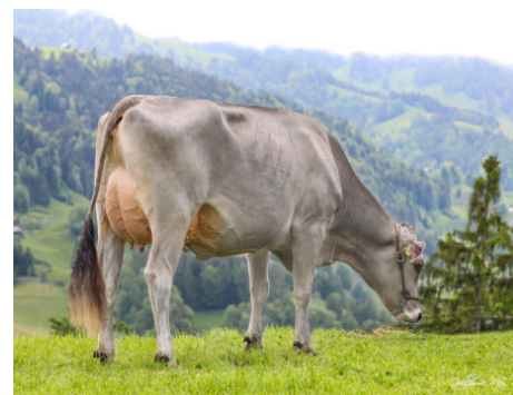
DAM: H.U. Huser's Calvin ROMINA 'E 93 E 96 MS'

Sire: HUGE SG Dam: H.U. Huser's Calvin Romina 'E 93 E 96 MS' 4-01 305D 2X 24,138 4.1 977 3.7 891 5-4 R.I.P 106D 2x 10,207 4.0 412 3.4 346 MGS: Vetschs Nesta Calvin MGD: H.U. Huser's Blooming Ronja 'E 93 E 96 MS' LIFETIME- 5 LACTATIONS 118,457M 3.8 4,456F 3.5 4,145P