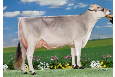
BLOOMING MANA MGD: 196BS59388 MAGNUM