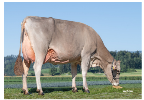
Canyon Mimi 'V 86 V 86 MS' DAM OF 196BS59388 MAGNUM

Sire: Scherma Noro GUY Dam: MIMI SG-ET 'V 86 V 86 MS' 2-00 305d 2x19,235 3.9 750 3.8 728 3-02 305d 2x 23,210 4.3 988 3.9 911 MGS: CANYON MGD: Blooming MANA 6-03 305d 2x 22,611 4.6 1,049 3.6 822 LIFETIME- 1,577d 100,890m 4,572f 3,631p