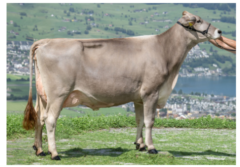
Brice Beila 'E 93 E 94 MS' Dam of 196BS59517 BOLERO

European Bulls (USA Only) AMIR X BRICE X HAEGER