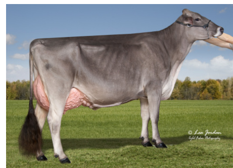
Giesy Manor Richard Fauna - 3rd Lactation 1st Place 4-Year-Old Southwest Fall National 2020 Honorable Mention All-American Jr. 3-Year-Old 2019 Owned by Edge-View Genetics, New York & Kentucky