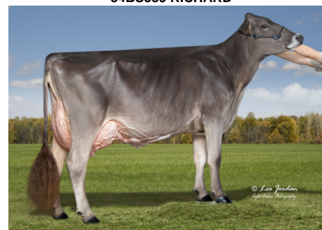
Pit-Crew Richard Pizza - 3rd Lactation 2nd Place 4-Year-Old Southwest National Fall 2020 Reserve All American Jr. 3 Year Old 2019 2nd Jr-3-Yr-Old World Dairy Expo 2019 Grand Champion Minnesota State Fair 2019 Owned by Pit-Crew Genetics, MN