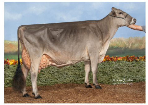
Triangle Acres Pandora-ET NOMINATED ALL AMERICAN AGED COW 2022 Owned by Triangle Acres, IL