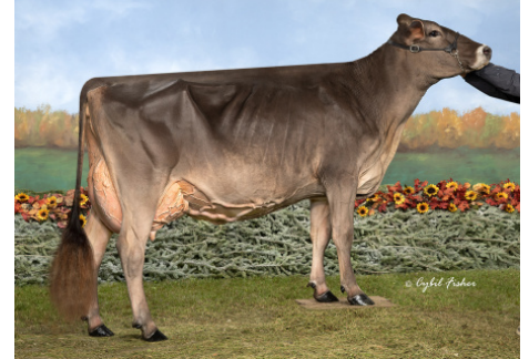
Pit-Crew Rich Peaches-Twin ALL AMERICAN 4 YAER OLD 2020 Owned by Pit-Crew Genetics, MN