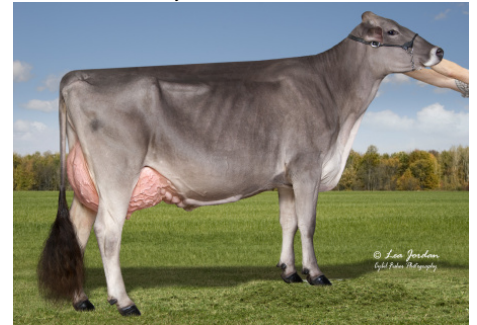
Giesy Manor Richard Fauna - 3rd Lactation 1st Place 4-Year-Old Southwest Fall National 2020 Honorable Mention All-American Jr. 3-Year-Old 2019 Owned by Edge-View Genetics, New York & Kentucky