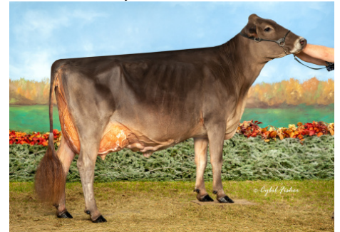
Pit-Crew Rich Prankster ET ALL AMERICAN 4 YEAR OLD 2021 Owned by Pit-Crew Genetics, MN