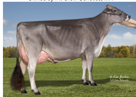
Giesy Manor Richard Fauna - 3rd Lactation 1st Place 4-Year-Old Southwest Fall National 2020 Honorable Mention All-American Jr. 3-Year-Old 2019 Owned by Edge-View Genetics, New York & Kentucky