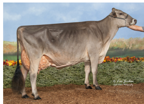
Triangle Acres Pandora-ET NOMINATED ALL AMERICAN AGED COW 2022 Owned by Triangle Acres, IL