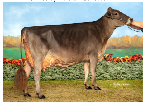
Pit-Crew Rich Prankster ET ALL AMERICAN 4 YEAR OLD 2021 Owned by Pit-Crew Genetics, MN