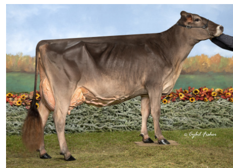
Pit-Crew Rich Peaches-Twin ALL AMERICAN 4 YAER OLD 2020 Owned by Pit-Crew Genetics, MN