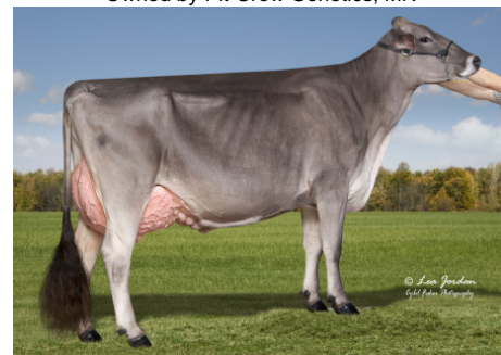
Giesy Manor Richard Fauna - 3rd Lactation 1st Place 4-Year-Old Southwest Fall National 2020 Honorable Mention All-American Jr. 3-Year-Old 2019 Owned by Edge-View Genetics, New York & Kentucky