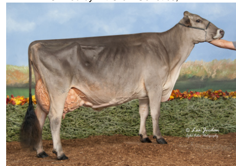
Triangle Acres Pandora-ET NOMINATED ALL AMERICAN AGED COW 2022 Owned by Triangle Acres, IL