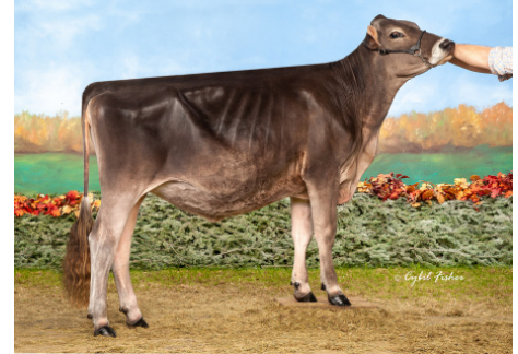
Pit-Crew Formula Tawny Junior Champion, World Dairy Expo 2021 Owned by Pit Crew Genetics, MN