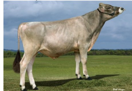
54BS548 Brown Heaven Winning Formula ET