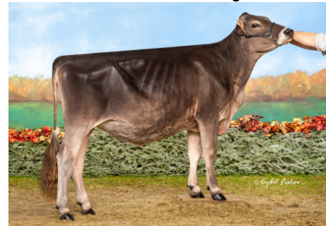
Pit Crew Formula Tawny Junior Champion, World Dairy Expo 2021 Owned by Pit Crew Genetics, MN