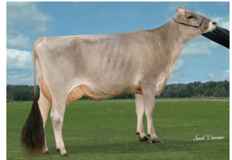
HF Lucky Darling 4629 Owned by Hendel Farms, Minnesota