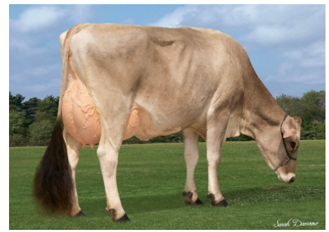
Hilltop Acres Donut Twin Owned by Hilltop Acres, Iowa