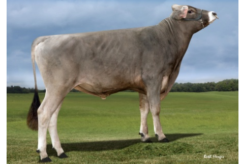
54BS557 GET LUCKY ET*TM