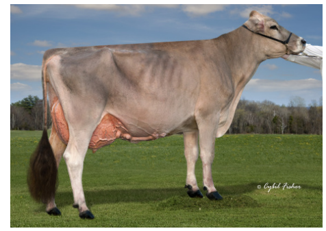
Sunny Acres Get Lucky Dreamcatcher 3rd Lactation Owned by Sunny Acres Farm