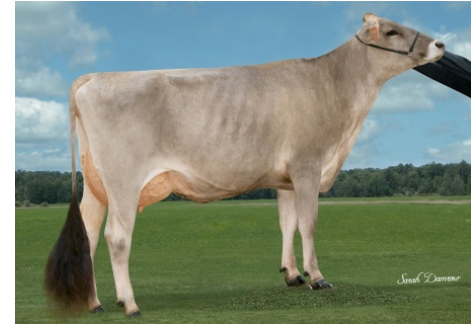
HF Lucky Darling 4629 Owned by Hendel Farms, Minnesota