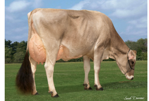
Hilltop Acres Donut Twin Owned by Hilltop Acres, Iowa