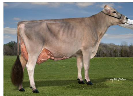
Sunny Acres Get Lucky Dreamcatcher 3rd Lactation Owned by Sunny Acres Farm

Sire: Huray Dam: Harts Lady Lust ET 'E90 E90MS' 5-01 365d 3x 37,783 4.7 1,781 3.1 1,169 MGS: Top Acres C Wonderment ET *TM MGD: Bail-Mik P Lady Liberty ET 'E91 E91MS' Lifetime: 1,046d 104,810m 4,337f 3,607p