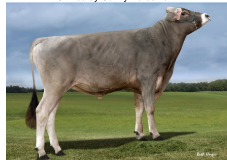
54BS557 BMG Lust Get Lucky ET