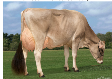
Hilltop Acres Donut Twin Owned by Hilltop Acres, Iowa