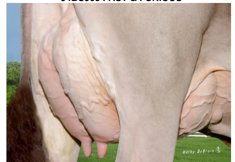
R N R Fast & Furious Pizazz ET owned by R N R Swiss, OH