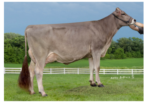
R N R Fast & Furious Pizazz ET Owned by R N R Swiss, OH