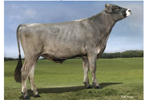
54BS568 FAST & FURIOUS