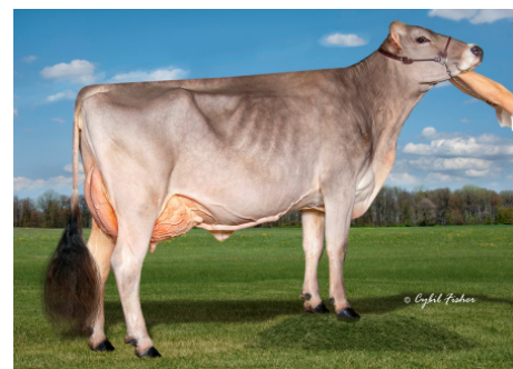
Brown Heaven F&F Daughter Owned by Brown Heaven, Canada