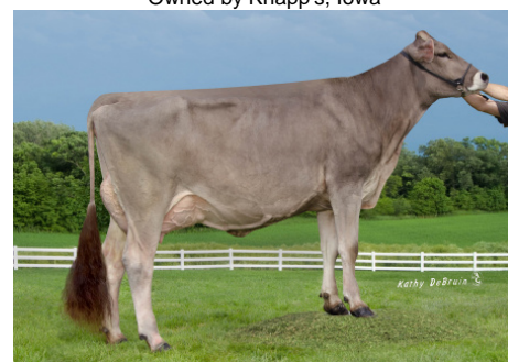
R N R Fast & Furious Pizazz ET Owned by R N R Swiss, Ohio