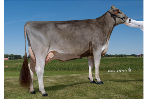
Cozy Nook Carl Tamango