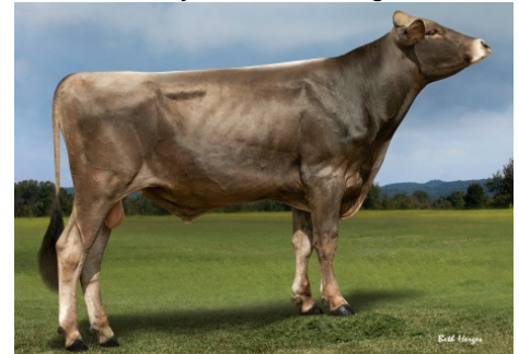
54BS573 LUCKY CARL ET*TM