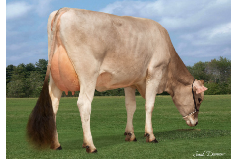
Hilltop Acres Carl Disney Owned by Hilltop Acres, Iowa