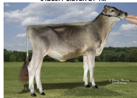
La Rainbow Silver Sweet Vibrant Owned by La Rainbow Farm, OH