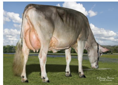
Dam: La Rainbow Sweet Silk ETV 'E90 E 91 MS' (2nd Lact)