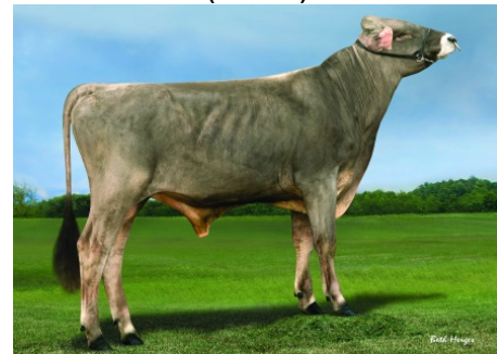
54BS577 SILVER ET*TM