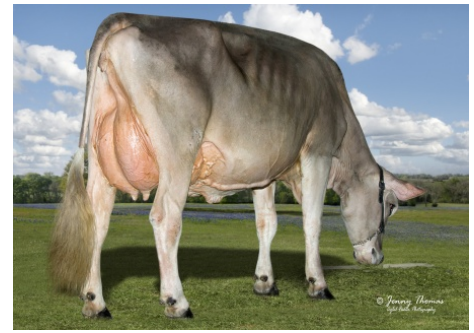
Dam: La Rainbow Sweet Silk ETV 'E91 E 91 MS' 2nd Lactation Photo