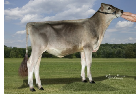
La Rainbow Silver Sweet Vibrant Owned by La Rainbow Farm, Ohio