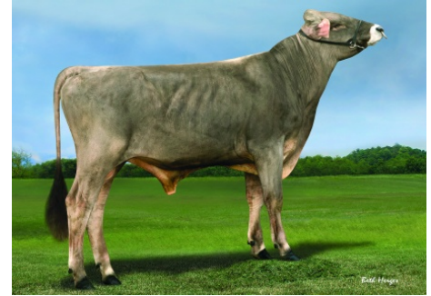
54BS577 SILVER ET*TM