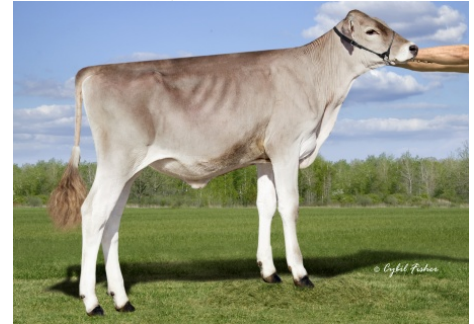
Hills Valley Silver Winslow Bred by Hills Valley, New York