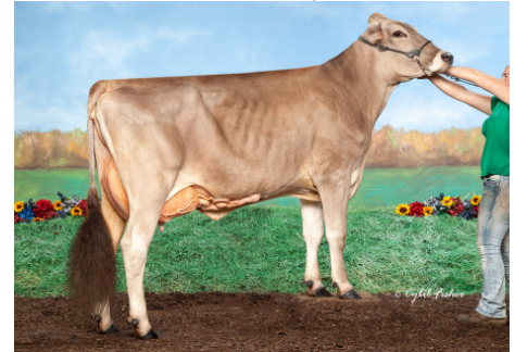
Heilinger Silver War