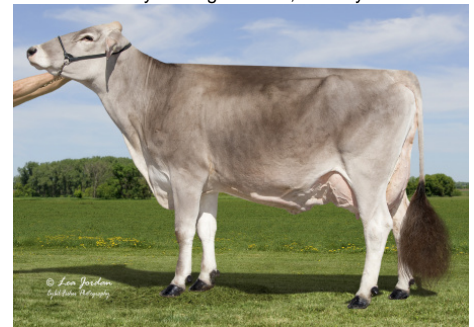
Hilltop Acres S Keegan