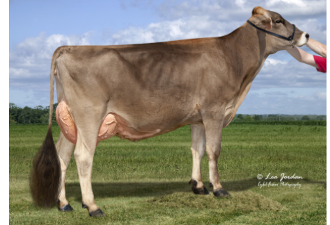
VB Silver Zoro