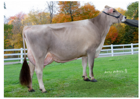
RNR Silver Panera