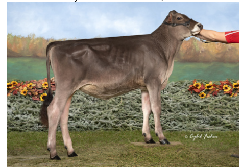
Pit-Crew Rasta Tricky ALL AMERICAN SPRING CALF 2022 Owned by Pit-Crew Genetics, MN