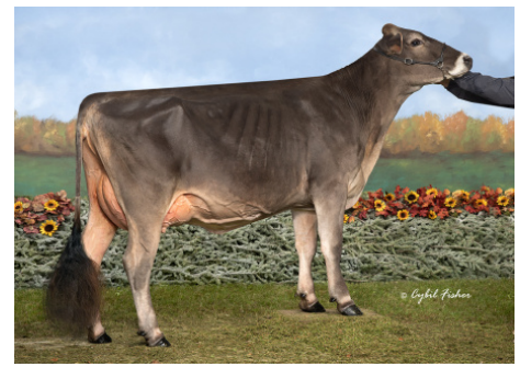
Pit-Crew Rasta Panama-ET Owned by Pit-Crew Genetics, MN