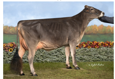
Pit-Crew Rasta Panama-ET Owned by Pit-Crew Genetics, MN