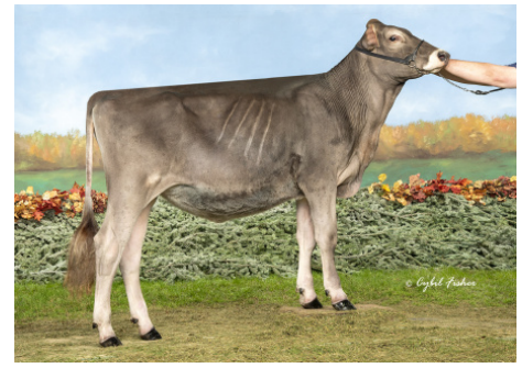
Jenlar Rasta Westlynn ETV 1st Fall Calf & Junior Champion World Dairy Expo 2023 Owned by Seimers Holsteins, Wisconsin