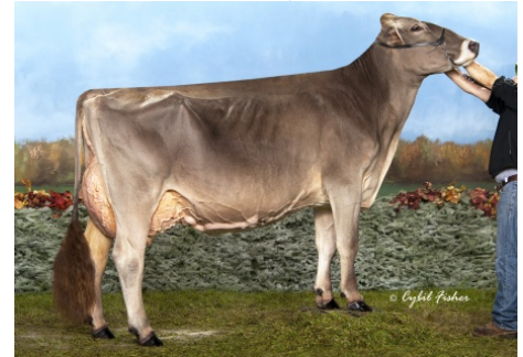
Dam: Jo-Dee Nemo Risky '2E 94 E 94 MS' Lifetime: 1,968d 143,950M 5,288F 4,644P Reserve All-American 2014 & Honorable Mention All-American 2012, '13 & '16 Member of All-American Sr. Best 3 Females 2013 & '14