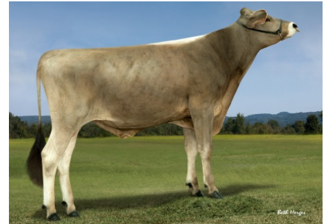
Triangle Acres Carter Juke *TM