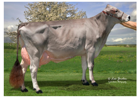
Triangle Acres Dirk Jupiter 'E90' 3rd Lactation

Sire: Voelkers TD Carter Dam: Triangle Acres Dirk Jupiter 'E 90' 2-11 365d 2x 23,334 4.3 1,012 3.7 856 1st Jr. 3 Year Old IL State Fair 2018 MGS: Switzer Tals Alimony Dirk ET MGD: Triangle Acres Prsu Juniper 3-02 365d 3x 25,700 4.3 1,097 3.5 911