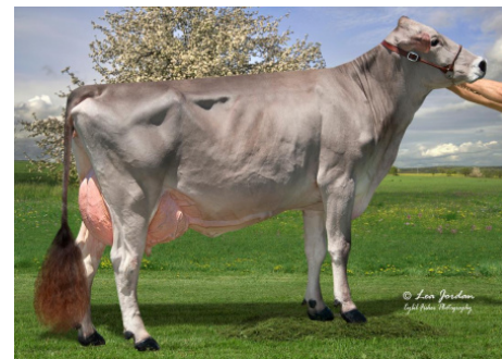
Triangle Acres Dirk Jupiter 'E 93 E 92 MS' 3rd Lactation Photo 2-00 308d 2x 18,570 4.5 832 3.6 663 2-11 365d 2x 23,334 4.3 1,012 3.7 856 R.I.P. 4-11 235d 2x 19,254 4.6 892 3.2 616

Sire: Voelkers TD Carter Dam: Triangle Acres Dirk Jupiter 'E 90' 2-11 365d 2x 23,334 4.3 1,012 3.7 856 1st Jr. 3 Year Old IL State Fair 2018 MGS: Switzer Tals Alimony Dirk ET MGD: Triangle Acres Prsu Juniper 3-02 365d 3x 25,700 4.3 1,097 3.5 911