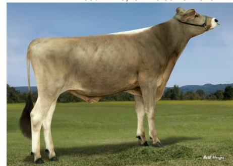
Triangle Acres Carter Juke *TM