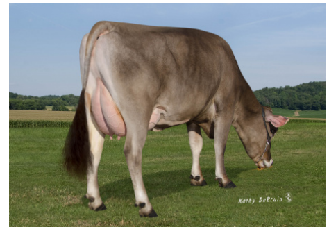
Switzer Tals Biver Donosa- Maternal Sister to DOBOY