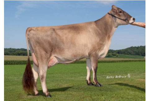
Dam: Switzer Tals Cdnc Donay ET 'VG 86 VG 86MS'