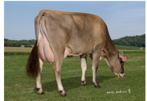
Switzer Tals Thunder Donia- Maternal Sister to DOBOY