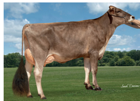
HF Doboy Dolly VG-87 Bred and Owned by Hendel Farms, MN