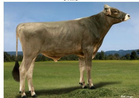
54BS584 TOBY ET*TM