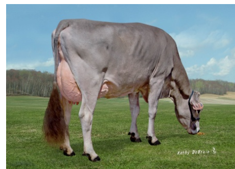
Dam: Cozy Nook Psli Treacherous 'EX 90 EX 91MS'