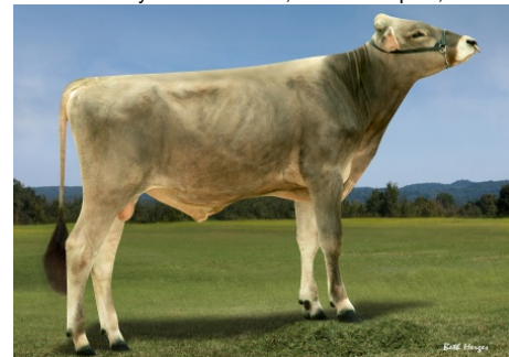
54BS585 Kulp-Terra Daryou Cliff ET