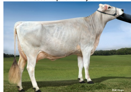
Voelkers Brook Cara 'V 89 E 90 MS' @ 2 YRS