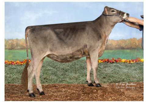
Arthurst Kade Panda *NP Owned by Encore Genetics, Wisconsin