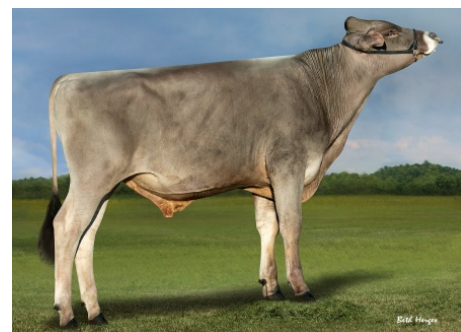
54BS590 Cozy Nook Tonka Catapult

Proven Sires, Preferred Sex TONKA x ETLAR x TORCH