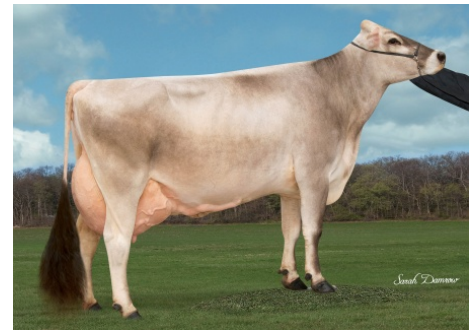
Dam: Hilltop Acres Bk Maui '2E 91 E 91 MS'

Sire: Cozy Nook Driver Tonka Dam: Hilltop Acres BK Maui ET '2E 91 E 91 MS' Lifetime: 1,785d 191,067m 7,686f 6,848p MGS: R N R Payoff Brookings ET MGD: Olson Music Dynasty Ming ET 'V 89' Lifetime: 1,685d 137,240m 7,418f 5,230p