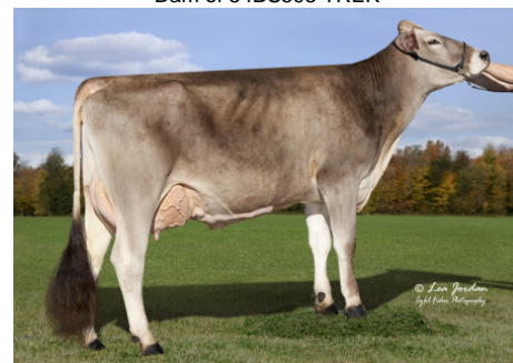
Hilltop Acres T Karina ETV Owned by Hilltop Acres, IA