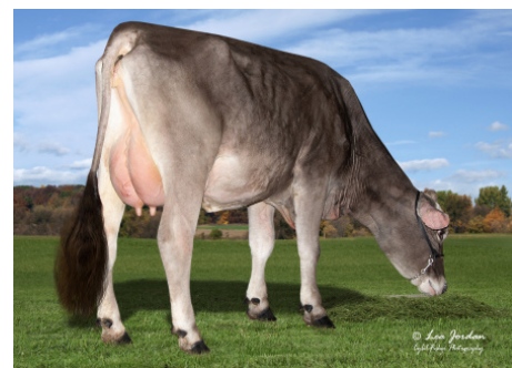
Perry Brook Trek Idris Owned by Richville Farms, VT

Sire: Kulp Terra Lucky Carl ET Dam: Cozy Nook Psli Treacherous-ET 'E90' 7-10 365d 2x 46,083 3.9 1,782 3.3 1,518 MGS: Payssli ET MGD: Cozy Nook Pronto Twylight '4E92' Lifetime: 4,094d 335,810m 14,739f 11,958p