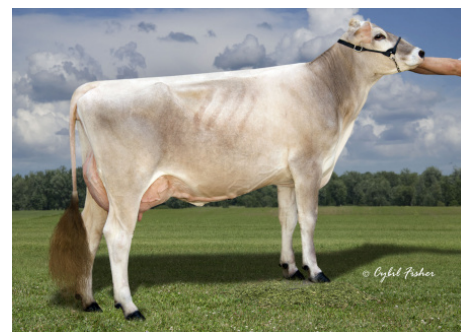
Dam: Hilltop Acres Gln Dignity ET 'E 90' 4-02 305d 3x 30,960 4.6 1,435 3.6 1,121 Lifetime: 1,289d 104,311 4,878F 3,800P

Sire: La Rainbow Bfly Dynamite ETV Dam: Hilltop Acres Gln Dignity ET 'E 90' 5-04 326d 3x 28,470 4.6 1322f 3.6 1037p MGS: Schamaun BS Gordon Glenn ET MGD: Hilltop Acres V Divinity '2E-91' 2046d 142,460m 6481f 5577p