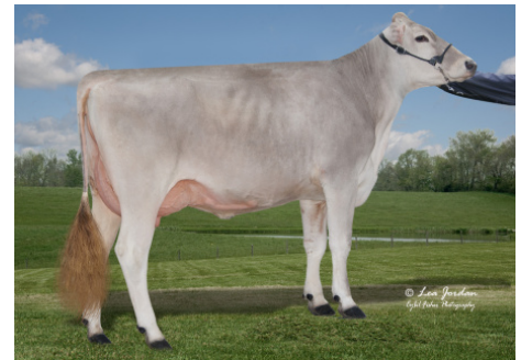
Heilinger Dramatic Gasp Owned By Heilinger Swiss, Pennsylvania