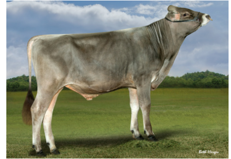
54BS598 HF Dramatic ET

Dam: HD Cadence Dream ET 'E 90 E 90 MS' 1-11 345d 2x 24,000 4.1 975 3.5 833 3-00 365d 2x 25,390 4.5 1,150 3.5 890 4-07 325d 2x 26,480 4.4 1,171 3.3 861 R.I.P. 5-06 101d 2x 9,705 4.7 455 3.1 301