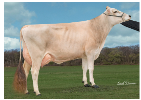
Hilltop Acres CAD PAULA 'V 87 V 88 MS' 1-11 365d 3x 32,990 4.6 1,522 3.8 1,257

Sire: Cozy Nook Daredevil Toby ET Dam: Hilltop Acres Cad Paula 'V 87 V 88 MS' 1-11 365d 3x 32,990 4.6 1,522 3.8 1,257 MGS: Jo-Bo Vigor Bush ET *TM MGD: Hilltop Acres Bush Denver '+ 83 V 85 MS' 4-03 365d 3x 33,360 4.3 1,432 3.7 1,241