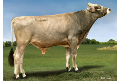
Hilltop Acres Powerball ETV