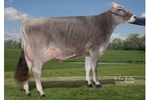
CIE Heilinger Powerball Demand Owned By Heilinger Swiss, Pennsylvania