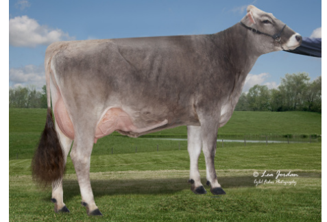
CIE Heilinger Powerball Demand Owned By Heilinger Swiss, Pennsylvania