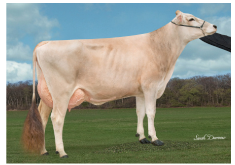
Hilltop Acres CAD PAULA 'V 87 V 88 MS' 1-11 365d 3x 32,990 4.6 1,522 3.8 1,257

Sire: Cozy Nook Daredevil Toby ET Dam: Hilltop Acres Cad Paula 'V87 V88 MS' 1-11 365d 3x 32,990 4.6 1,522 3.8 1,257 MGS: Jo-Bo Vigor Bush ET *TM MGD: Hilltop Acres Bush Denver '+ 83 V 85 MS' 4-03 365d 3x 33,370 4.3 1,432 3.7 1,241