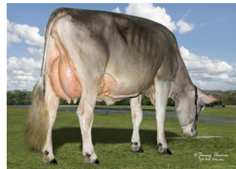
La Rainbow Cadence Sweet Silk 'E 90 E 91 MS' 1-09 365d 2x 26,240 5.0 1,321 3.9 1,025 3-07 365d 2x 26,896 5.3 1,425 3.5 930